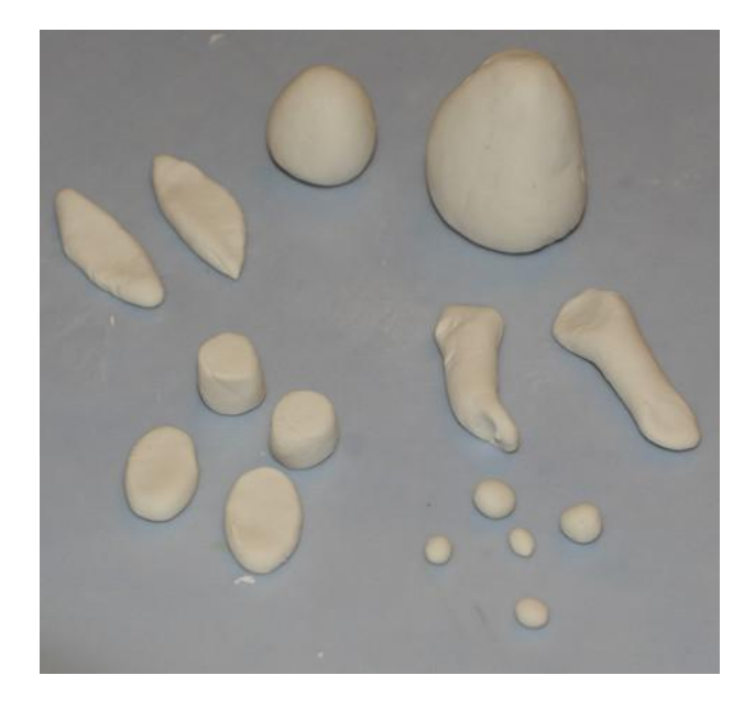
Assemble the bunny's face first. Moisten each piece so they will stick firmly to each other.

Set this aside and begin sculpting the bunny. Using the white clay, make two egg shapes with one of the shapes being 1 ½" tall and wide and the smaller being ½' tall and wide. Roll out two small beads and press into flat circles for the bunny's cheeks. Pinch a small triangle for the nose, a tiny coil for the lip and two long tear shapes for the ears. To make the arms, roll out two coils and to make feet, roll out two small cylinders and two tear drops. Make sure to roll out several very small ovals to look like miniature Easter eggs.